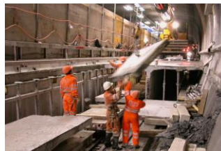
Construction works at the San Bernadino Tunnel