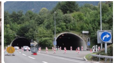
Traffic detour during restoration of the Murg-Walenstadt Tunnel