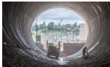
Tunnel portal Galgenbuck Tunnel