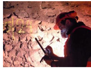
Use of a touchpad for tunnel inspection