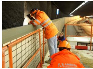
Inspection of a road tunnel