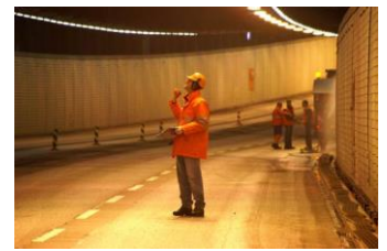
Visual inspection of the ceiling in a road tunnel