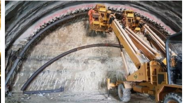
New construction of the 3rd tube in Gubrist tunnel