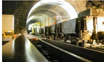
Renovation of Axentunnel