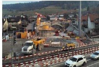
New construction of the 3rd tube in Gubrist tunnel