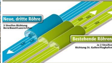
New construction of the 3rd tube in Gubrist tunnel