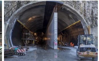
Ceneri base tunnel