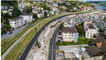
Renovation Project A2 Hergiswil