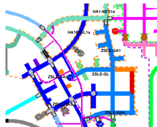
Tunnel network optimisation