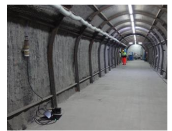
Buried data transmission underground