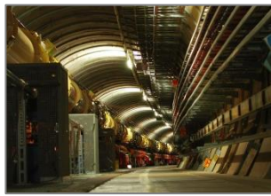
Study comprising cost estimate for structural works