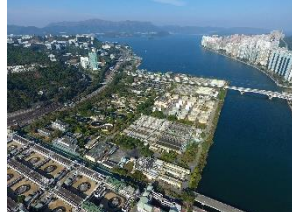
Quantitative risk analysis and Design Review