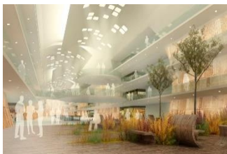
Feasibility, preliminary design, cost estimate

Conditions placed on the environmental compatibility of facilities lead to expensive measures. Some of the facilities need a high level of protection, while others require uniform environmental conditions. Building a facility in an underground cavern can be the optimal solution – underground facilities need less or no land, have less impact on the surrounding countryside, prevent certain obligations, offer uniform climatic conditions and very high levels of protection.