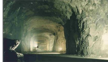
Feasibility studies, stability analysis and ventilation concept