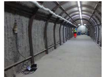
Buried data transmission underground