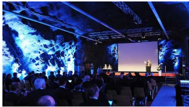
Volumetric Design and construction technology