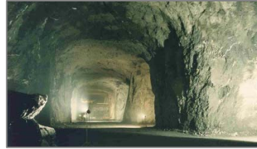
Feasibility studies, stability analysis and ventilation concept