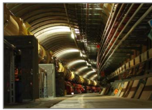
Study comprising cost estimate for structural works