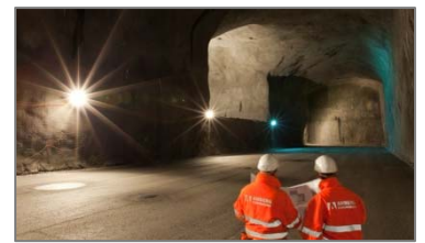
Implementation, site supervision