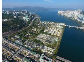
Quantitative risk analysis and Design Review